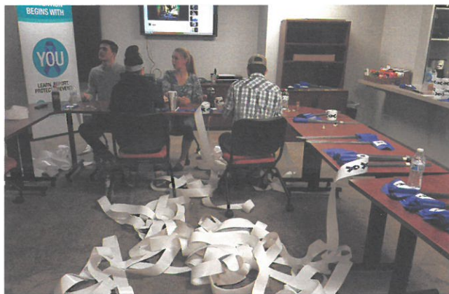
Teens volunteered to assemble over 4,000 blue ribbon flags at PFSA office.

Volunteer. You can help with special events, outreach and general office work. PFSA also welcomes applications from students at all levels to be interns in our programs.