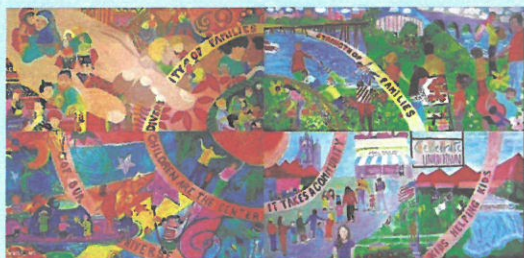
The 2009 murals.

Each of the 26 murals created between 2008 to 2016 is available as a poster, which can be purchased from our online store at www.pa-fsa.org . They make great additions to your office walls, and serve as reminders that child abuse prevention happens every month. ●