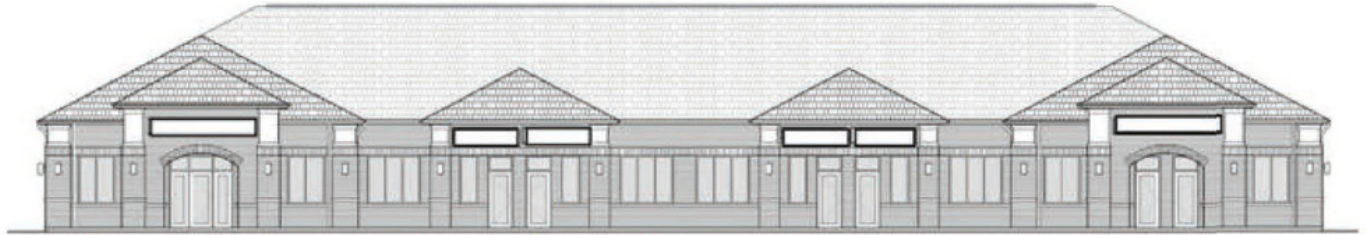
FRONT ELEVATION BUILDING C

Cary Square Professional Center 835 Feinberg Court Cary, IL 60013