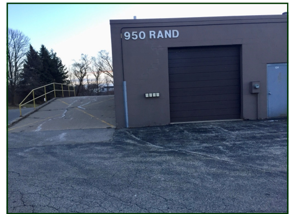
Exterior Dock Shared by Entire Complex