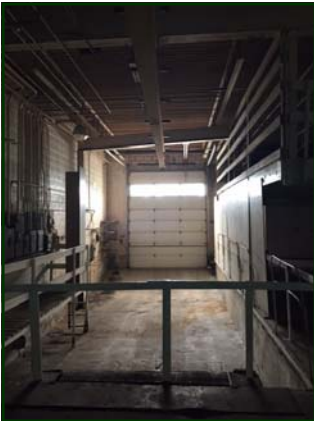
Interior Loading Dock