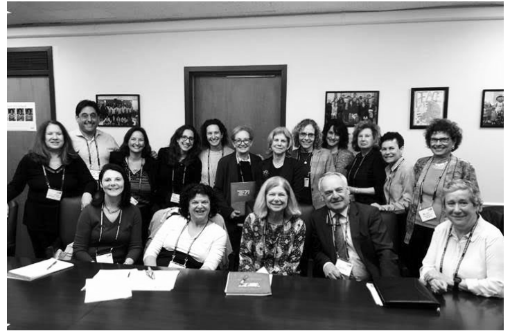
Temple Israel Members Join NYRAC in Albany to Lobby Statehouse on Greenlight Initiative

to protecting the "stranger," the bill has significant public safety benefits for all. The bill would allow undocumented individuals to be properly licensed and insured road safety for all. This bill would also insure that police can properly handle the policing of these drivers as they do with all other NY drivers (the police chiefs of both Ossining and Port Chester have endorsed the bill). In addition, the bill is estimated to add upward of $50,000,000 in annual revenue for New York State from the fees it would collect.