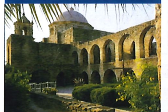
Mission San Jose is one of America's great landmarks