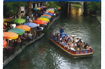
Relax on a cruise at the famous River Walk