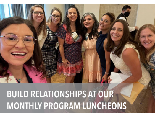
BUILD RELATIONSHIPS AT OUR MONTHLY PROGRAM LUNCHEONS