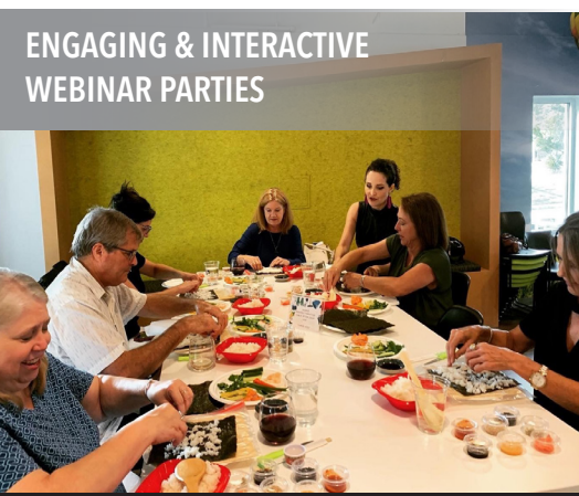
ENGAGING & INTERACTIVE WEBINAR PARTIES