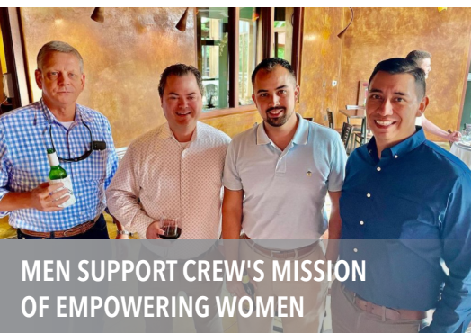
MEN SUPPORT CREW'S MISSION OF EMPOWERING WOMEN