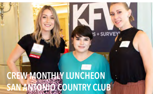
CREW MONTHLY LUNCHEON SAN ANTONIO COUNTRY CLUB