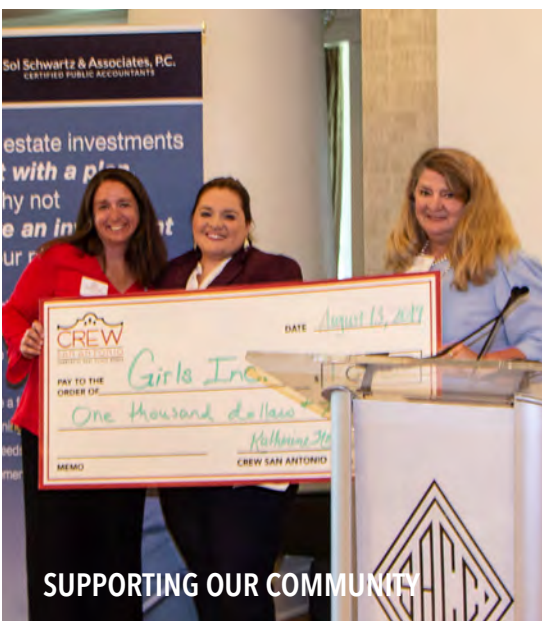
SUPPORTING OUR COMMUNITY

CREW San Antonio paves the way, breaking barriers for women to enter and excel as leaders in Commercial Real Estate. We envision an inclusive industry which empowers women and their achievements.