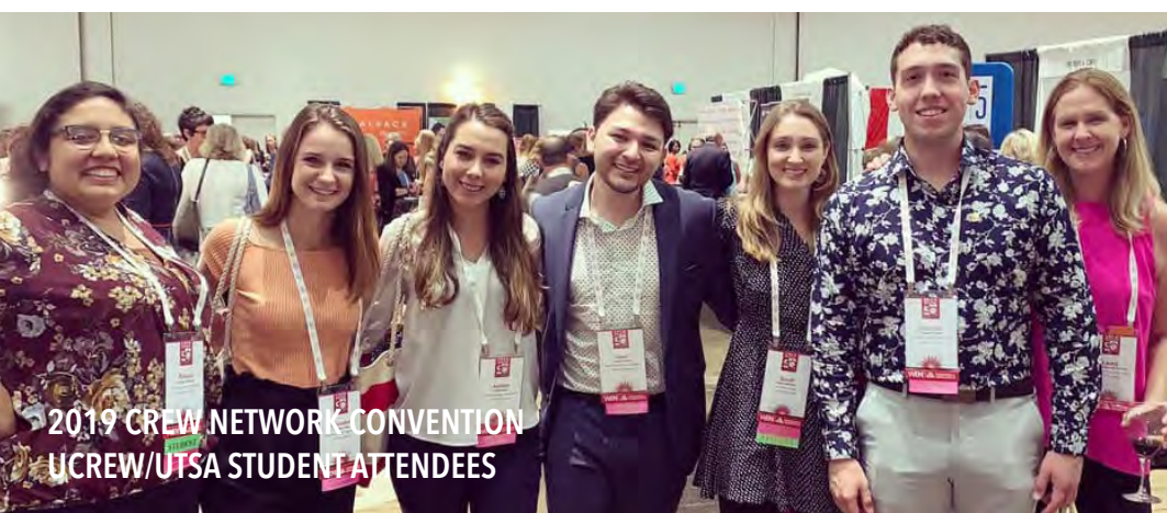
2019 CREW NETWORK CONVENTION UCREW/UTSA STUDENT ATTENDEES