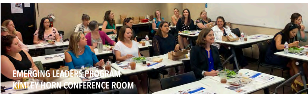
EMERGING LEADERS PROGRAM KIMLEY-HORN CONFERENCE ROOM