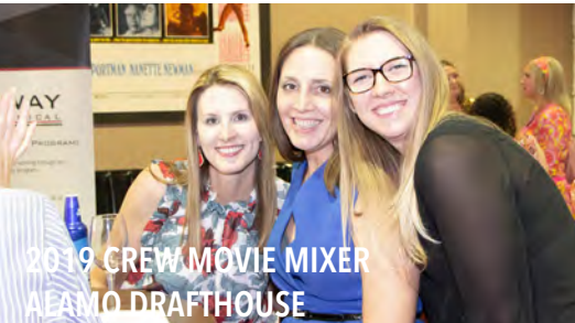
2019 CREW MOVIE MIXER ALAMO DRAFTHOUSE