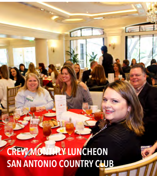
CREW MONTHLY LUNCHEON SAN ANTONIO COUNTRY CLUB