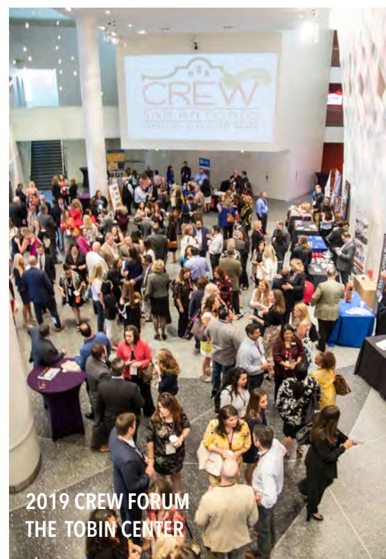
2019 CREW FORUM THE TOBIN CENTER