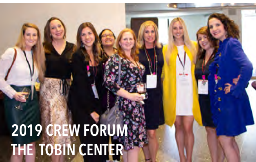
2019 CREW FORUM THE TOBIN CENTER