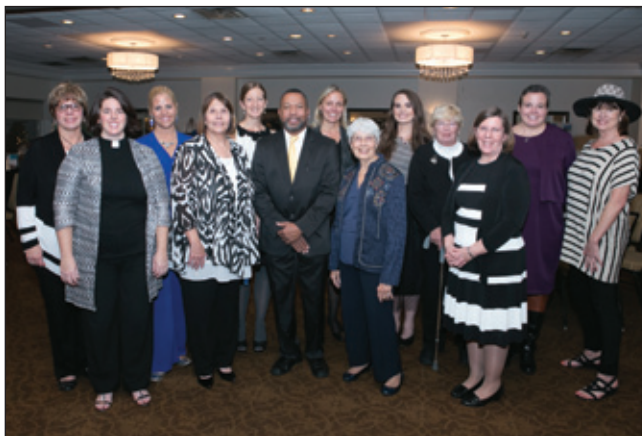
Fundraiser planning committee