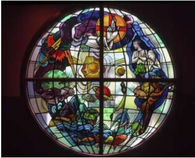
Creation Stained Glass Window