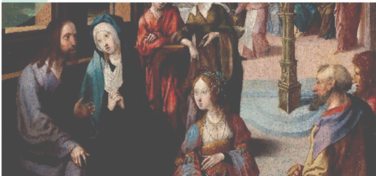
Christ's Second Visit to the Home of Mary and Martha

In today's Gospel, Jesus says to Martha, "Did I not tell you that if you believe you will see the glory of God?" Lent is a time for reflection and restoration. Reflect on what strengthens your faith and ways in which you can continue to build a strong foundation. How can you be more open to God's will in your life?