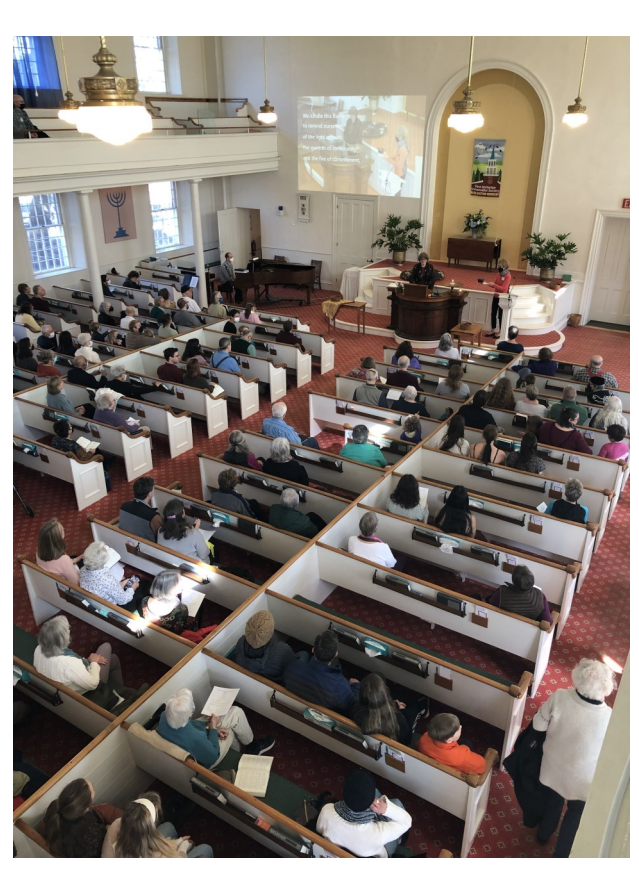
Easter Sunday service, April 9, 2023.