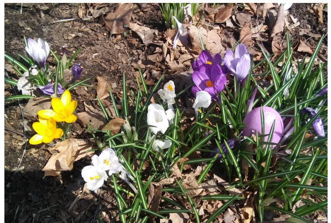
Memorial Garden Easter Egg Hunt, April 4, 2021