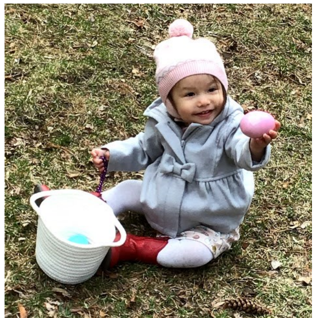
Memorial Garden Easter Egg Hunt, April 4, 2021