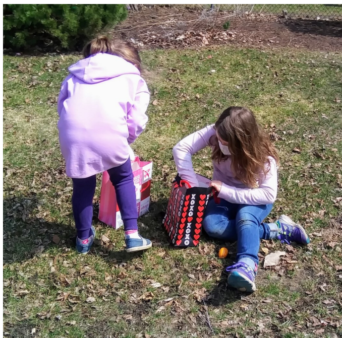
Memorial Garden Easter Egg Hunt, April 4, 2021

Or visit our archive at uusociety.org/publication-archives .