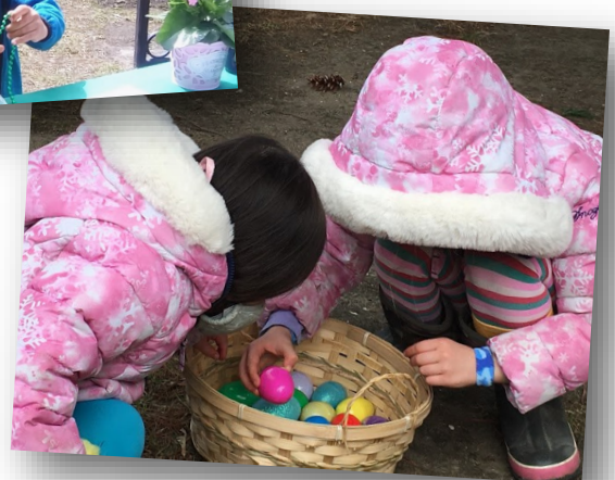
Memorial Garden Easter Egg Hunt, April 4, 2021