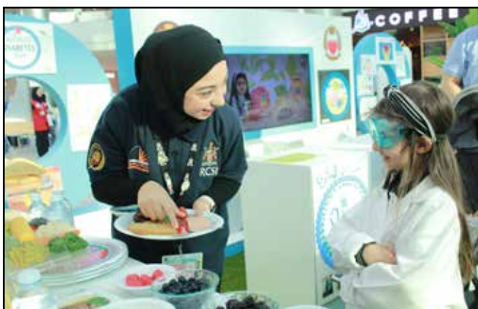
Advancing public health promotion in Bahrain.

World Diabetes Day-Public Event-Healthy Plate Activity The Diabetes Mobile Unit (DMU) programme aims to advance public health promotion in Bahrain through multisectoral collaboration, integrating education, research, and community engagement. The DMU programme fosters sustainable educational and research initiatives to prepare nursing and medical students as future health promotion leaders. Its mission is to empower children, families, and communities to enhance health literacy, adopt healthy lifestyles to reduce the risk of obesity and type 2 diabetes, and support effective diabetes self-care management. Through these efforts, the programme strives to create a lasting impact on the community's health and well-being.