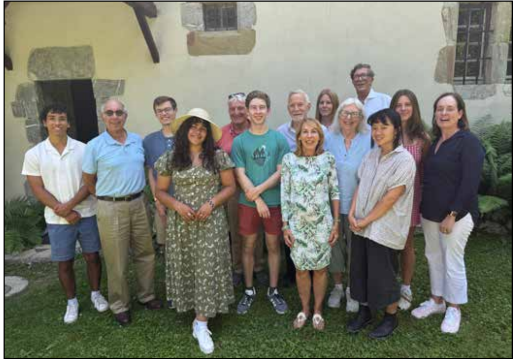
2025 Mac Jannet Scholars (with a few board members) in the garden at the Prieure

The Foundation actively works to strengthen this growing community. Each year, the MacJannet Foundation hosts a luncheon with scholars during its Medford-based board meeting, providing students an opportunity to engage directly with trustees and learn more about the Foundation's mission and legacy. In June, the Foundation also hosts a reception and outing in Talloires, bringing together scholars and trustees in the very place where the program's global learning experience unfolds.