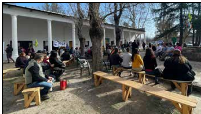
A symbolic site that has been transformed by the community into a space of life, memory, and hope.

El Refugio Libertad received Honorable Mention in the 2025 MacJannet Prize. The Refugio Libertad of Los Molinos, located in the province of Córdoba, Argentina, is a symbolic site that has been transformed by the community into a space of life, memory, and hope. This area, once a clandestine detention center during the last military dictatorship, now hosts a variety of community initiatives, ranging from gardens to educational projects.