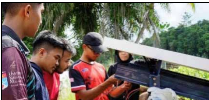
Implementing solutions to promote social justice and inclusive development for marginalized communities.

Accordingly, the program is structured around three (3) core objectives: 1) the empowerment of education, 2) the provision of alternative electricity sources and 3) the supply of clean water to rural communities in the states of Sabah and Sarawak. Established in 2016, the PPB initiative has successfully carried out its mission over nine consecutive editions, continuing into 2025.