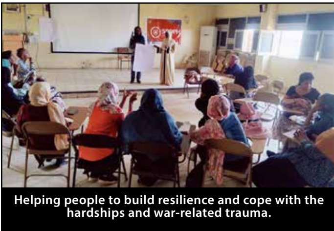
Helping people to build resilience and cope with the hardships and war-related trauma.

Medical Force During Conflict is the First Place Winner of the 2025 MacJannet Prize for Global Citizenship. The program was established in 2023 with the outbreak of war in Sudan by the Medical Students' Association of Ahfad University for Women. Recognizing the urgent need for mental and psychological health interventions, the Medical Force During Conflict program aimed to equip medical students with essential skills while also supporting the broader community. The focus has been on helping individuals (youth, women, men, and children) to build resilience and cope with the hardships and war-related trauma, offering mental and psychological support, and providing ways to assist those facing both mental and physical health challenges.