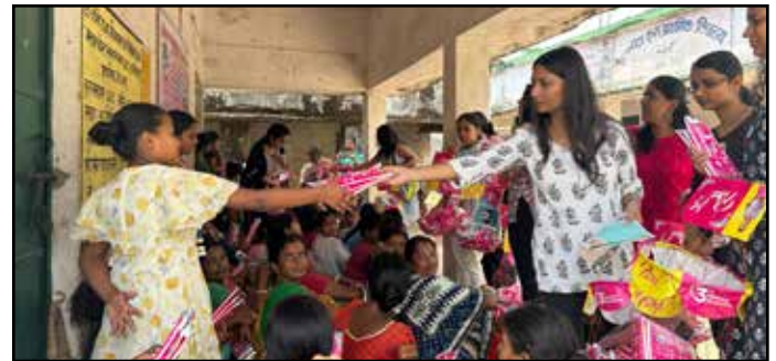
Organizing legal awareness camps and ensuring pro bono legal services for indigent complainants.

The Centre for Legal Aid Programme (CLAP) is the Second-Place Prize winner of the 2025 MacJannet Prize. CLAP is an integral centre of learning at the National University of Study and Research in Law (NUSRL), Ranchi, recognized by the Department of Justice, Ministry of Law and Justice, Government of India, under its Pro Bono Club Scheme. It is affiliated with the Jharkhand State Legal Services Authority (JHALSA) and the District Legal Services Authority (DLSA), Ranchi. The motto "Paritranaya Sadhunam" ("For the Support of the Virtuous") embodies the core ethos of CLAP and serves as a guiding principle for its endeavors. Established in 2011, the Centre is recognized for championing the contemporary and globally relevant domain of legal aid and awareness, working to uplift marginalized sections of society.