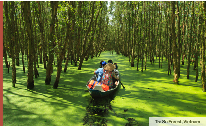
Tra Su Forest, Vietnam

February 7-14, 2028 | AmaMaya 7-night cruise from Siem Reap to Ho Chi Minh City