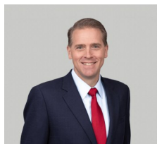
Trump & Congress: The First Seven Months

Scott Jennings is Senior Political Contributor for CNN and is one of the nation's most well-known conservative commentators. He appears daily on the network's various shows, including the 10pm debating show "Newsnight with Abby Phillip," where clips of his 4-on-1 exchanges go viral on a weekly basis.