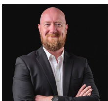
Using AI in the Collections Space