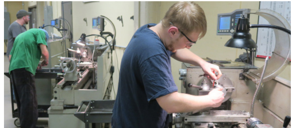
NCC was the site of the NTMA Pittsburgh Chapter annual apprentice competition on February 21.

New Century Careers and NTMA Pittsburgh work together year-round on a proven metalworking apprenticeship instruction program to support on-the-job training provided by employers. During the 2019-2020 instruction year, 137 apprentices participated in instruction.