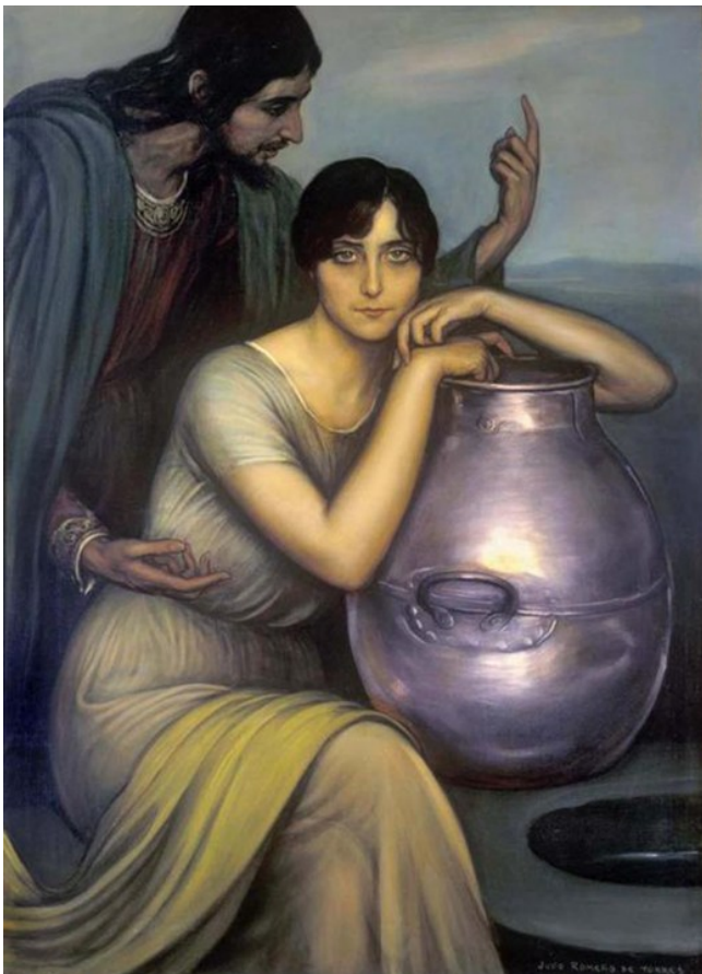
Romero de Torres, Julio, 1874-1930. Christ and the Samaritan Woman, from Art in the Christian Tradition , a project of the Vanderbilt Divinity Library, Nashville, TN.

Small Groups, Hikes, Worship, Sabbath Time