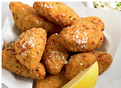
Crispy Fried Artichokes