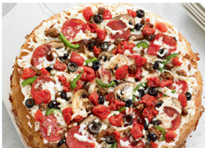
BJ's Favorite Deep Dish Pizza

Valid for dine in or take out. Not valid towards alcoholic beverages or Happy Hour specials. Please do not distribute flyers on-site during the event. Flyers must be printed and presented to the server.