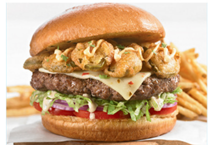
Crispy Jalapeño Burger