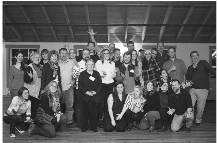
Residents and local businesses impacted by tourism are invited to attend this forum.