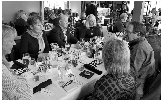
This year's event will be the 2nd Nordic Park Benefit Dinner.