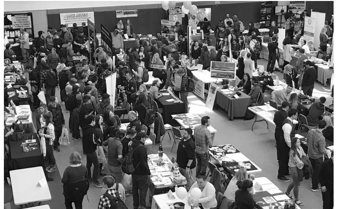
More than 750 high school juniors and seniors are expected to attend this year's Job & Career Fair.