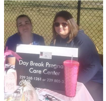
Health Fair 2024