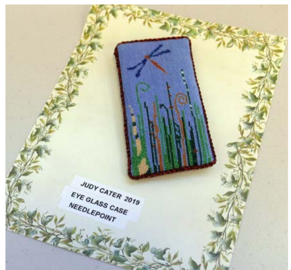
Art from the Heart