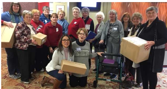
North Central Leadership Team Boxing Up Human Trafficking!