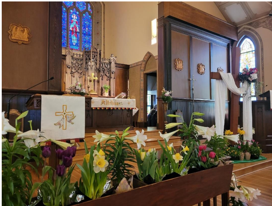
Easter Sunday, 2022