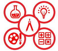
STEAM Science Technology Engineering Art Math