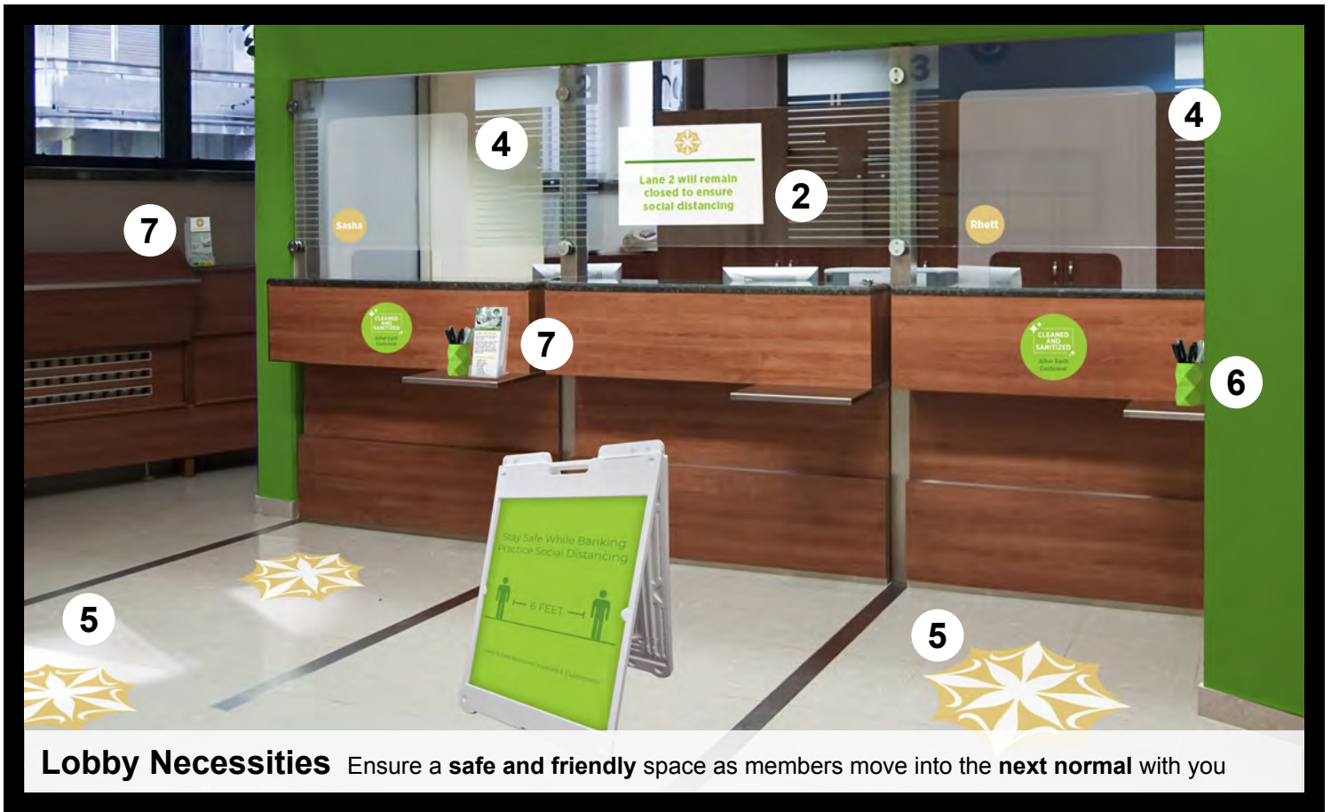
Lobby Necessities Ensure a safe and friendly space as members move into the next normal with you

4 | ACRYLIC PARTITIONS Made of clear material that can be disinfected regularly. Standard slot foot or bent bottoms as well as custom sizes are available with an access space integrated in the design.