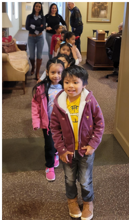
Photo: These kids from Wonderful Days preschool are preparing to sing for the Reach Out luncheons next Monday and Tuesday. Today they marched down the hall of the church for their first visit to the Parish Hall. They passed the Giving Tree, where gifts for them have been wrapped and labeled with stars. If you still have a gift for one of them, this Sunday is the last opportunity to place it under the tree!