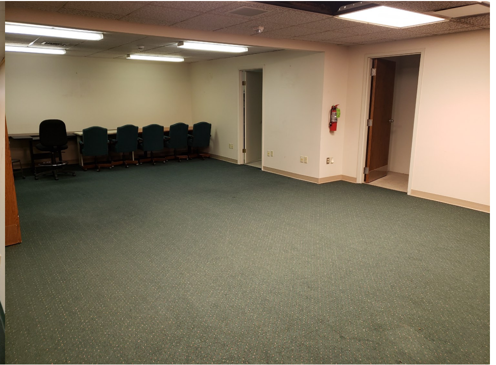
Conference Room on the Second Floor.