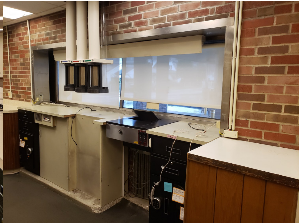
Drive through service window.