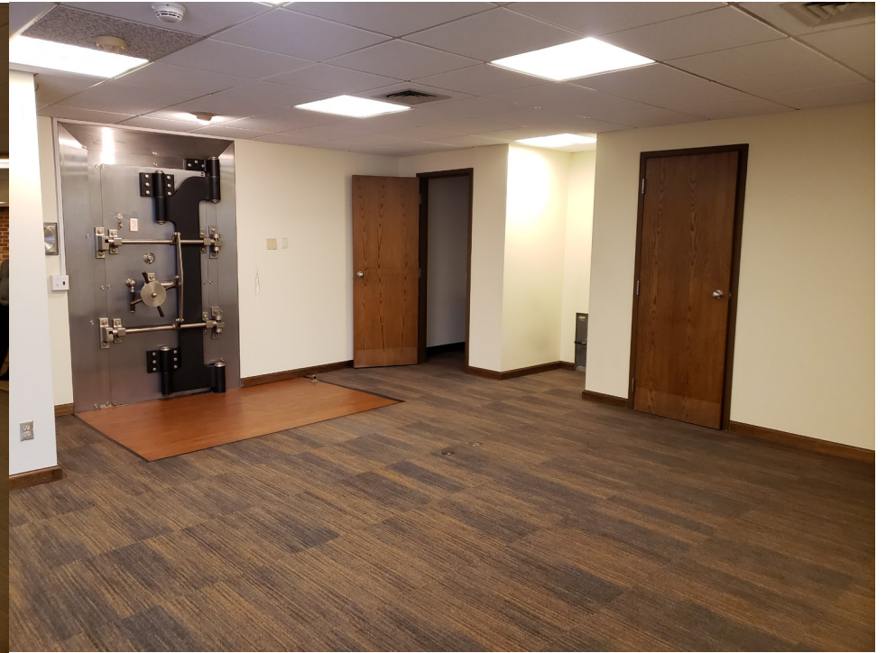
Looking from main entrance to the right of lobby.