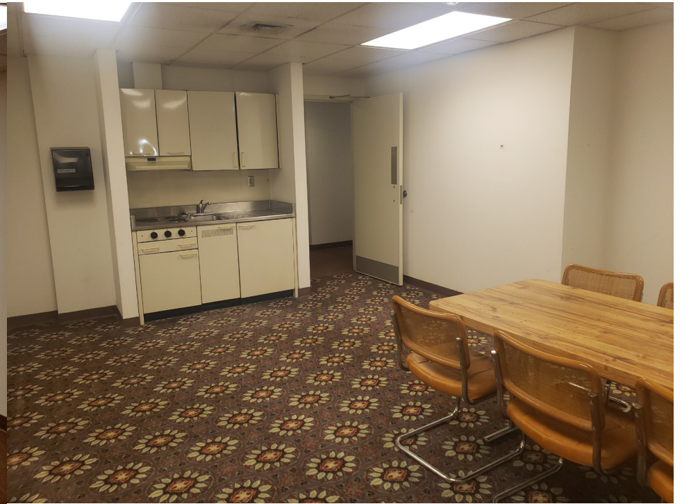
Break Room on the Second Floor.