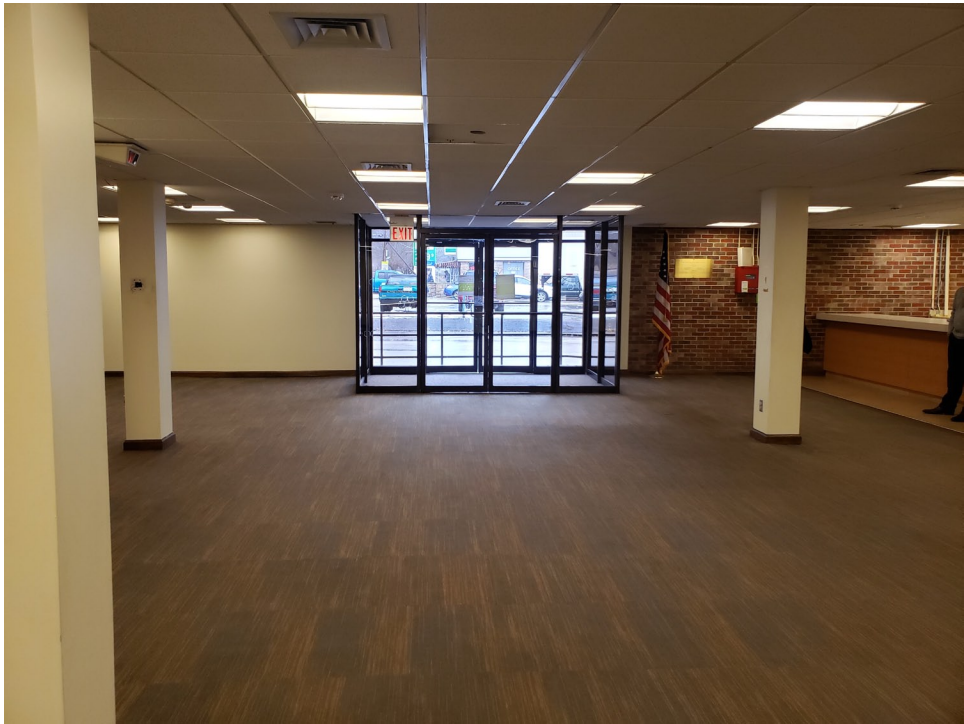
Looking from rear of lobby towards main entrance.