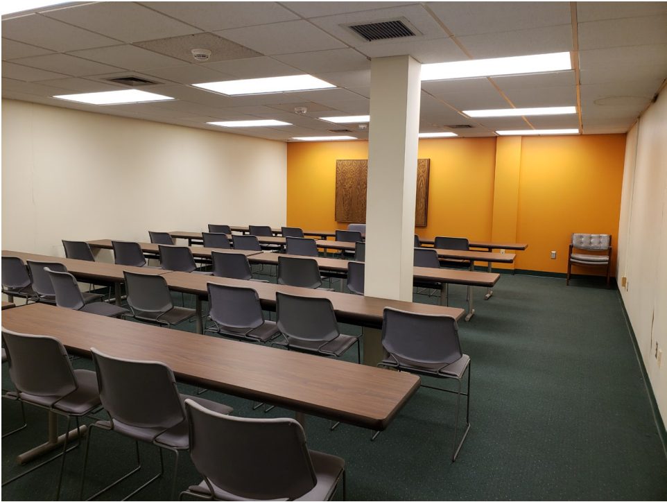
Conference Room on the First Floor.