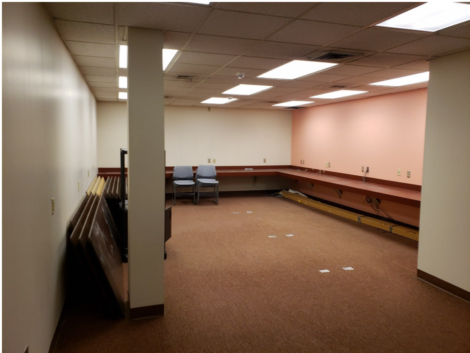
Training Room on the Second Floor.