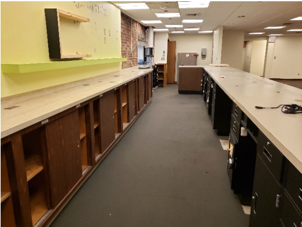
Looking from front of building down the service counter.