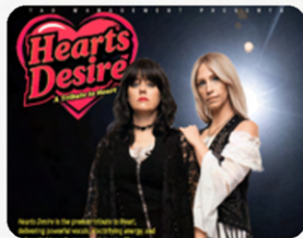
HEARTS DESIRE - HEART TRIBUTE Tuesday, May 12 Tickets go on sale March 10*