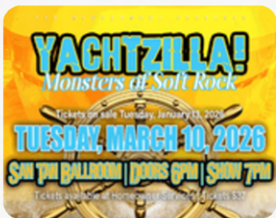
YACHTZILLA! SOFT ROCK Tuesday, March 10

Don't miss your chance to be part of the experience. Purchase your tickets online today and secure your seat for the next performance.