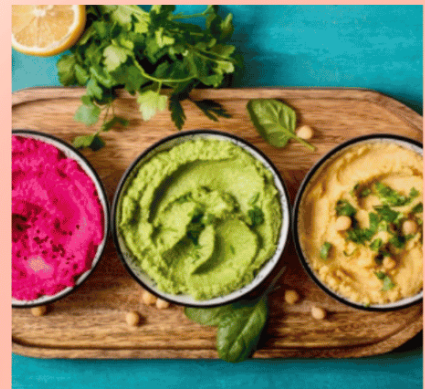
Hummus with Vegetable Coloring

Please bring cash or check to SL HOA #2 Administration office to sign up