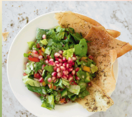
Fattoush with Sumac