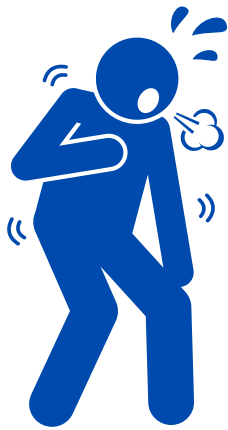
Shortness of Breath or Difficulty Breating

If you have the following symptoms, please come back and see us a different time.