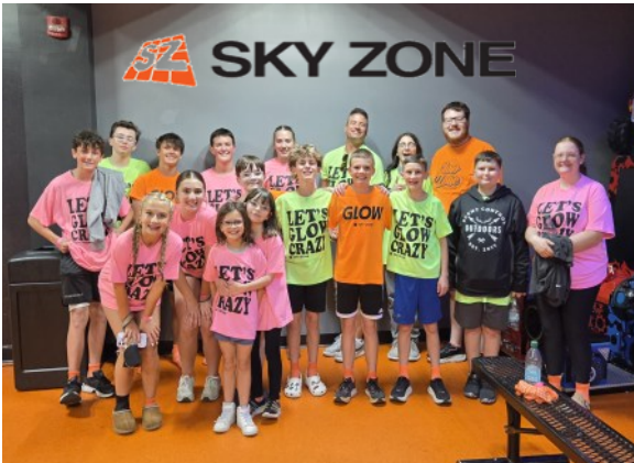
May 8, 2026

Thank you for your continued prayers and support for our youth ministry. We are excited to see what God has in store this summer!