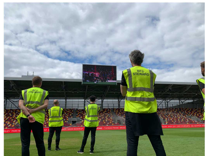
BFC stewards in the stadium ahead of pre-season friendly.

For televised games, staff from the broadcaster will also be present. The Club will need to secure an updated safety certificate in order for a limited number of supporters to be allowed inside our new home (whilst meeting social distancing guidelines).