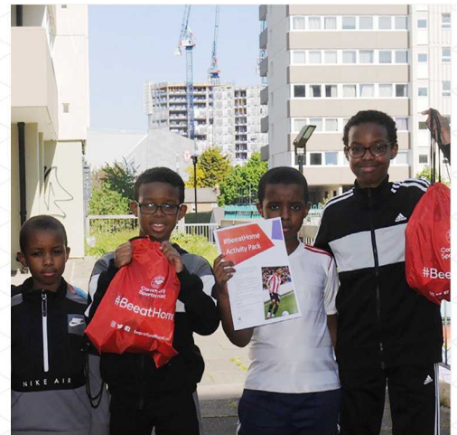
Brentford FC Community Sports Trust's #BeeatHome campaign