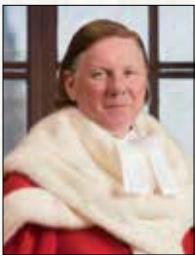
THE HONOURABLE MR. JUSTICE MALCOLM ROWE SUPREME COURT OF CANADA RECEIVING HONORARY FELLOWSHIP