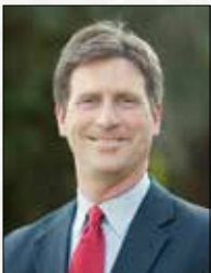
HONORABLE GREG STANTON MAYOR, CITY OF PHOENIX

Justice Rowe hails from Newfoundland and Labrador and earned his LL.B from Osgoode Hall Law School in 1978, when he was called to the Bar of Newfoundland and Labrador. He became a member of the Law Society of Upper Canada in 1986. While in private practice the Ottawa office of Gowling and Henderson, he worked on disputes over the determination of Canada's Atlantic maritime boundaries, and was involved in the negotiation of a new United Nations convention on high seas fisheries. Justice Rowe was appointed Queen's Counsel in 1992, and in 1996, he became Clerk of the Executive Council and Secretary to Cabinet in the Government of Newfoundland and Labrador. Justice Rowe was appointed to the Newfoundland and Labrador Supreme Court, Trial Division in 1999 and was elevated to the Court of Appeal of Newfoundland and Labrador in 2001. From 2002 to 2016, he was involved with Action Canada, a youth leadership development program, as an advisor, mentor and member of the National Selection Committee before being appointed to the Supreme Court of Canada on October 28, 2016.