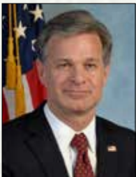
HONORABLE CHRISTOPHER WRAY DIRECTOR, FEDERAL BUREAU OF INVESTIGATION