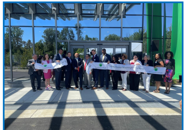
The ribbon-cutting ceremony for the new Shepherd Pratt Mental Health Facility