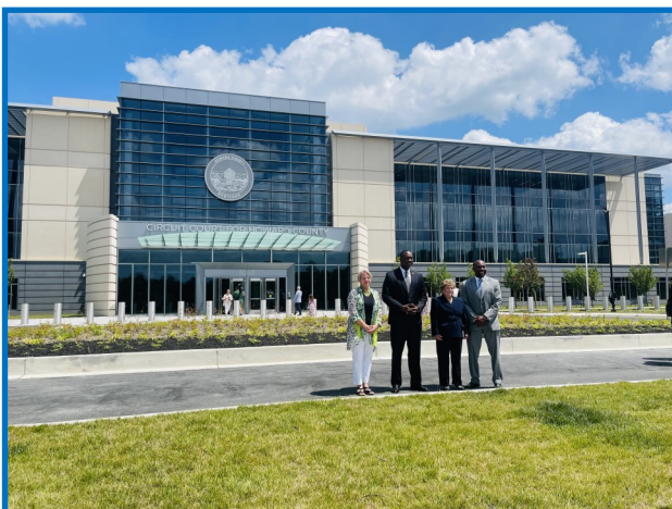
The ribbon-cutting ceremony for the new Circuit Courthouse in Howard County.