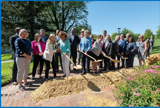
The groundbreaking ceremony for the new Mathematics and Arts Complex at HCCC.

July has been busy with groundbreaking ceremonies that demonstrates our continued investment in the community. As an elected official, I am honored to participate in these events on behalf of the citizens and pleased to see how Howard County is moving forward in a positive, innovative way.