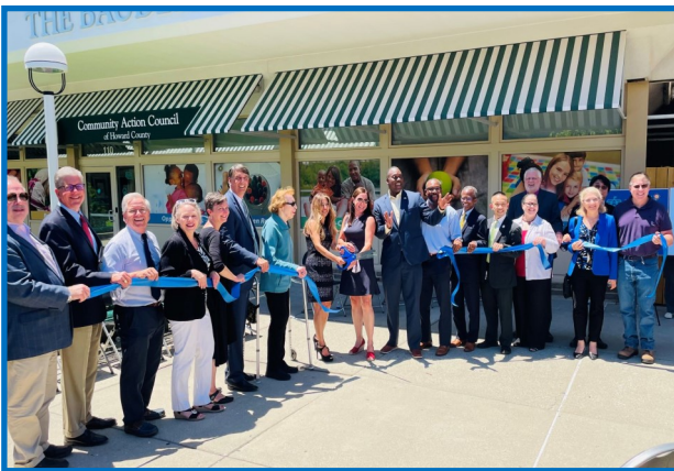
Ribbon-cutting ceremony for the Bauder Education Center by the Howard County Action Council

July has been busy with groundbreaking ceremonies that demonstrates our continued investment in the community. As an elected official, I am honored to participate in these events on behalf of the citizens and pleased to see how Howard County is moving forward in a positive, innovative way.