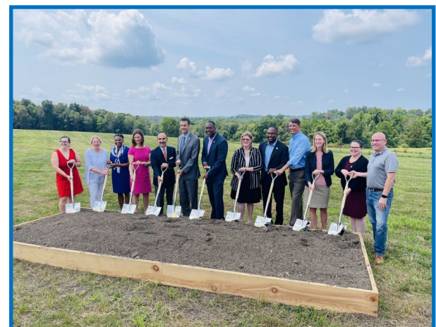
The groundbreaking ceremony for the new Solar Energy Project in Howard County.