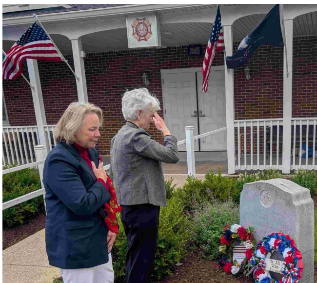
Memorial Day, Ellicott City, VFW