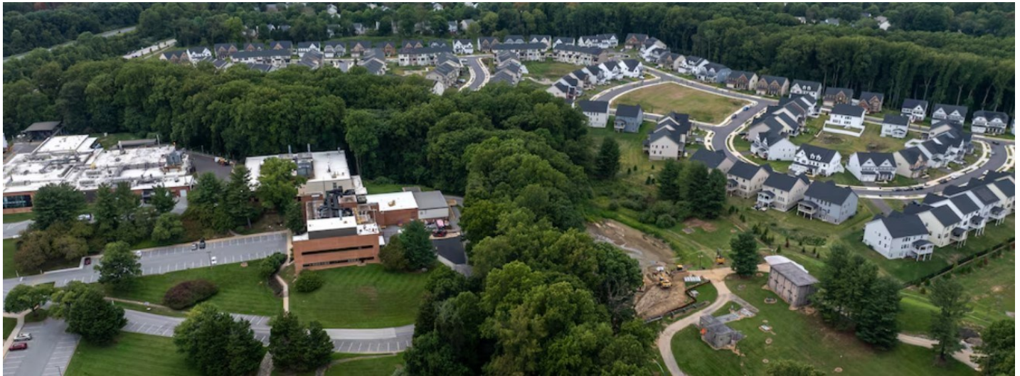
WR Grace and the Cedar Creek community

A person aggrieved by this decision may appeal it to the County Board of Appeals within 30 days.