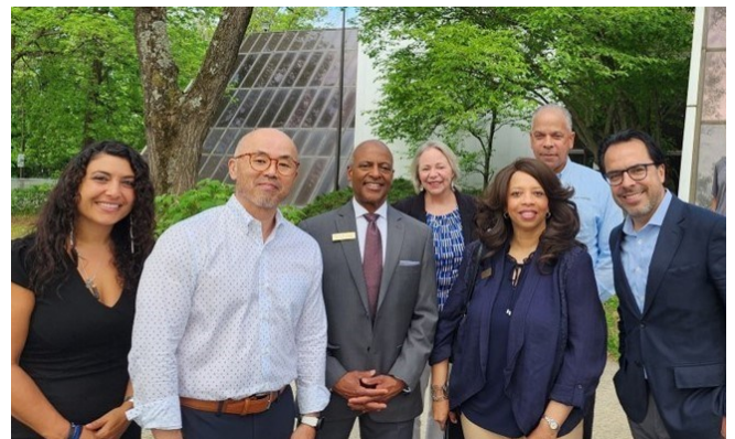
Community leaders gathered at the Columbia Flier building to commemorate the home of our hometown newspaper, the Columbia Flier .