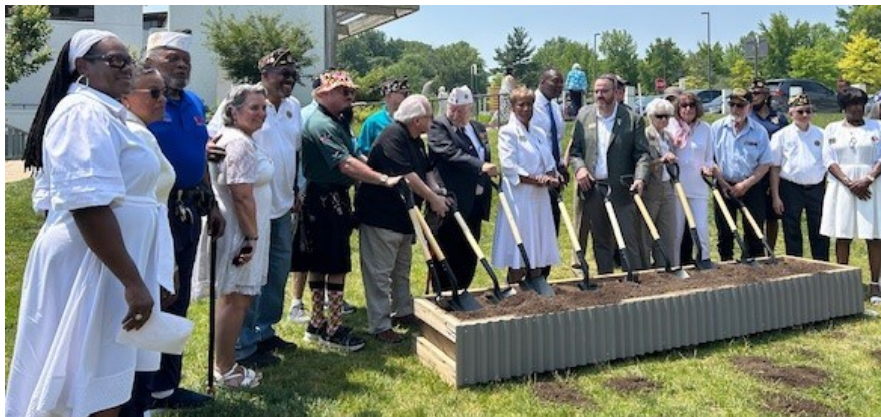
Howard County Veterans & Military Families Monument Groundbreaking