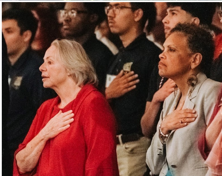
Military Enlistee Ceremony