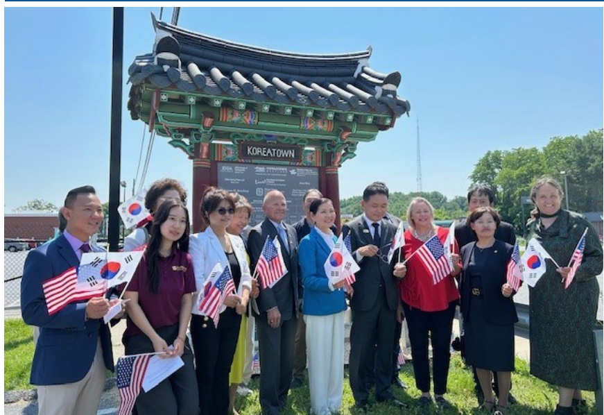
Korean War Memorial at the Koreatown Arch