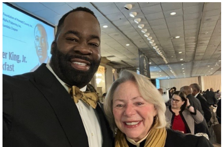
MLK Jr. Holiday Celebration