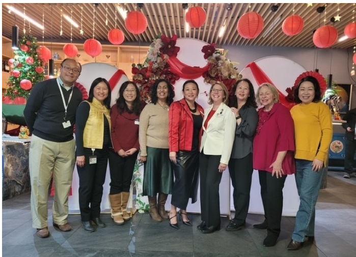
Asian American Educators Community Fundraiser