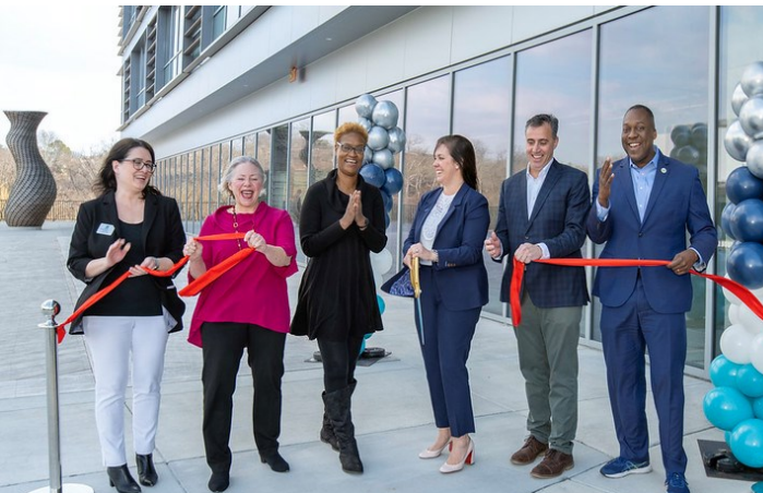
South Lakefront's Medical Building Grand Opening