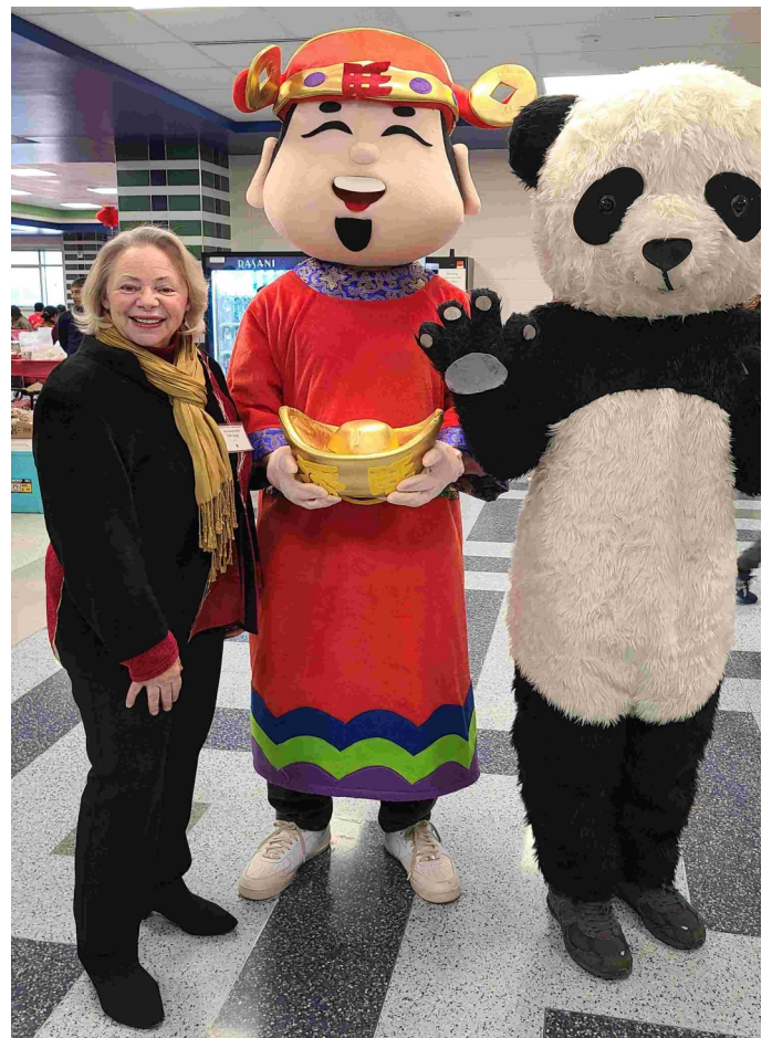
Lunar New Year Celebration At The Columbia Mall