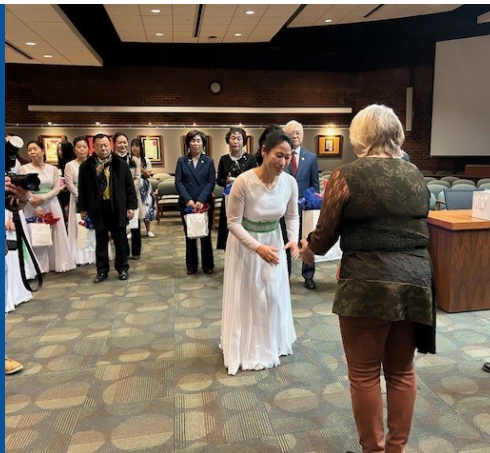
Korean Delegation Visit