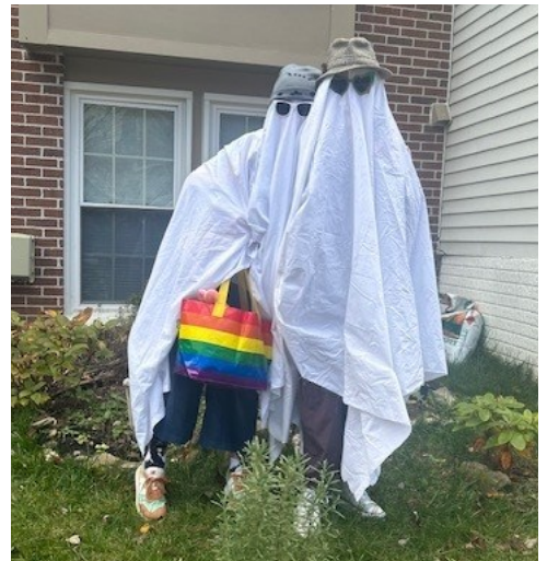
Two cool "sheet" ghosts spotted on Halloween.

Unfortunately, we are witnessing a great amount of suffering from the tumultuous consequences of war and violence. I'm sure many of us have given to causes that provide support to the innocent lives that have been impacted overseas. These types of conflicts also raise the specter of heated disagreements, hurtful labeling, fear of reprisals, and other situations that undermine people's sense of safety. We are not immune to the othering of each other that leads to a hardening of viewpoints. It is my hope that during this season of giving that we see ourselves in each other and recognize the humanity in our perceived enemies. The County's Office of Human Rights and Equity is hosting a public forum: Hate Has No Place, Reporting Hate Crimes & Hate Biased Incidents on November 8, 6-7.30pm, at The Meeting House. Click here for more.