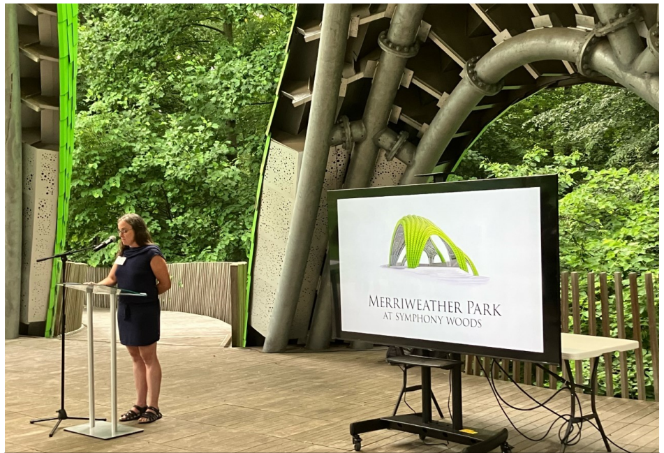
EcoWorks: Native Garden Installation