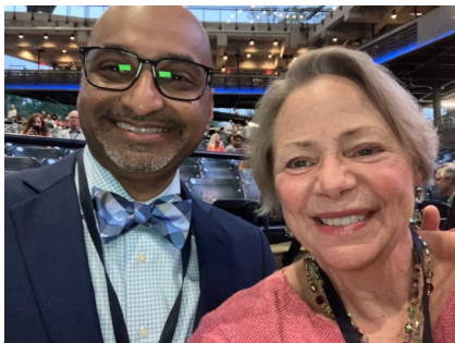
Heroes in Health Care