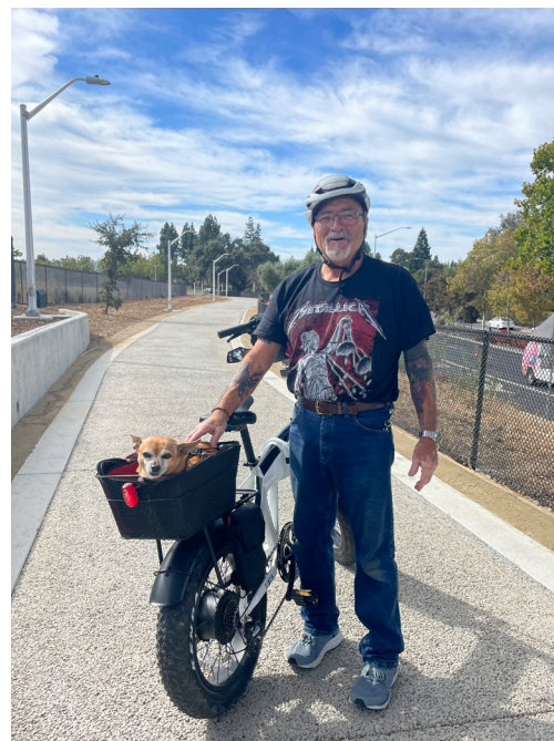
Pictured: Nighttime construction on Willow Pass Road (left and bottom); pavement resurfacing on Meadow Lane at Market Street (top); bicyclists enjoy the new Monument Boulevard pathway near BART (right).