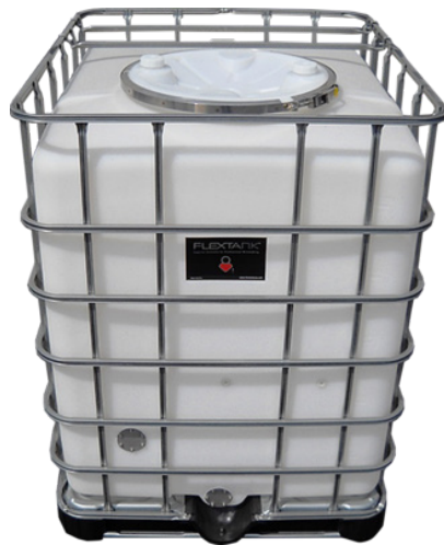
(1X) 300 GAL STACKER