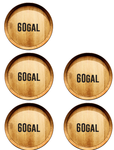
(5X) 60 GAL BARRELS