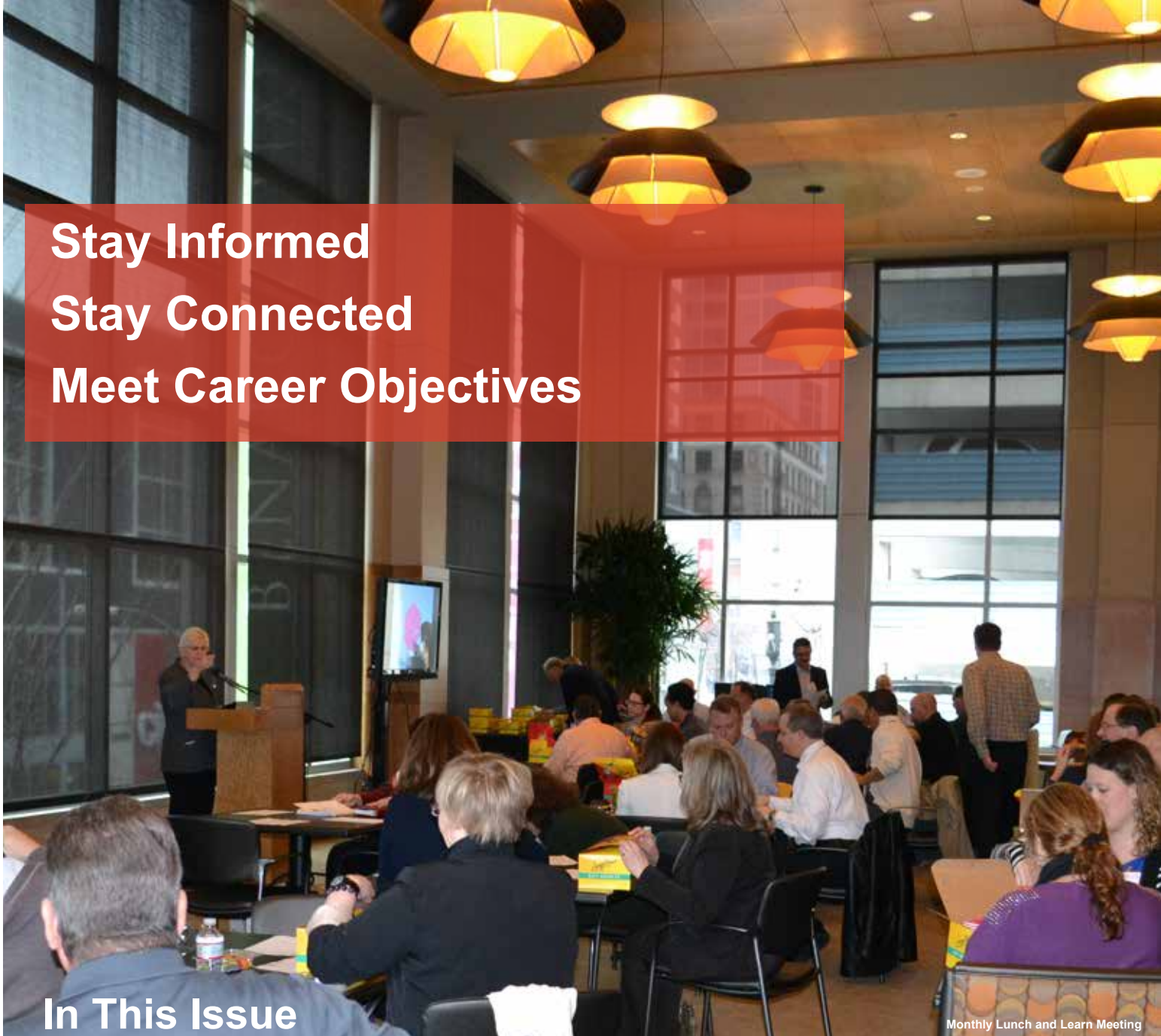
Monthly Lunch and Learn Meeting

Stay Informed Stay Connected Meet Career Objectives