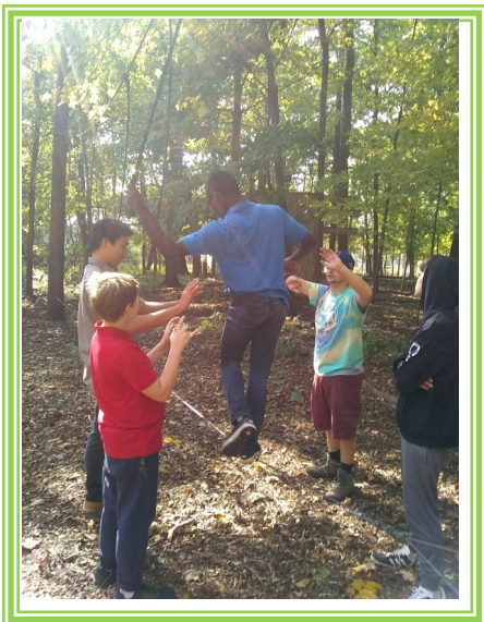
Our boys learning trust skills at Holiday Home Camp (left)