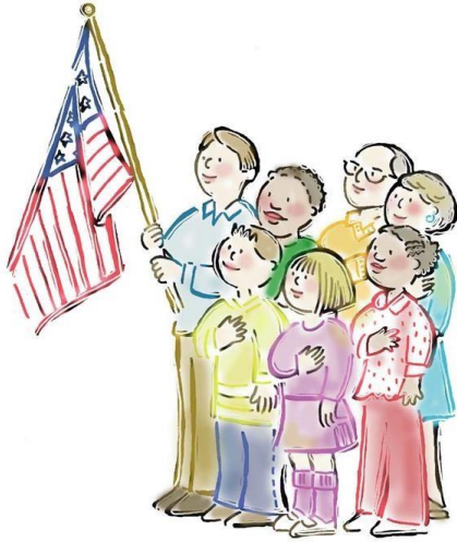
Veteran/Military Friendly Congregation