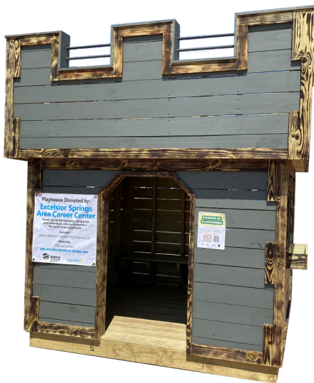
Excelsior Springs School District | 2021 Playhouse