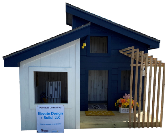
Elevate Design + Build | 2021 Playhouse