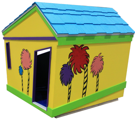
CKF, LLC | 2020 Playhouse