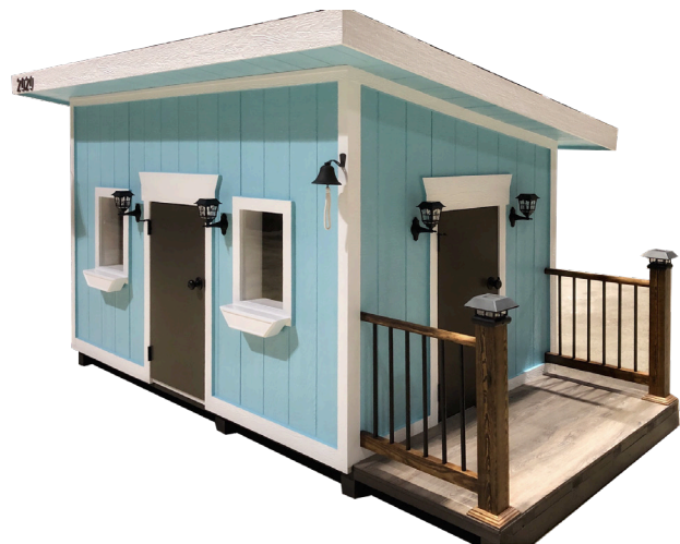
Grants Custom Homes | 2020 Playhouse