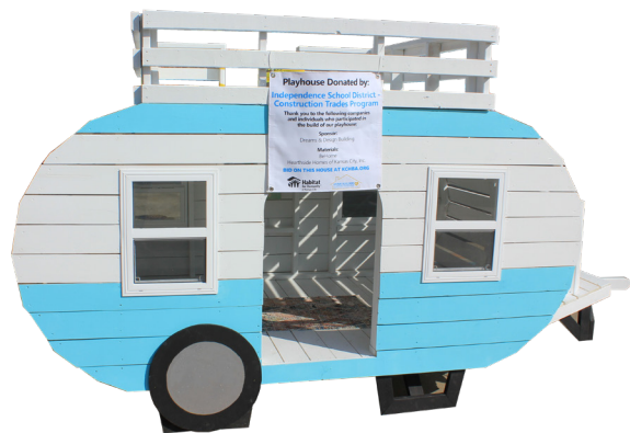
Independence School District | 2021 Playhouse