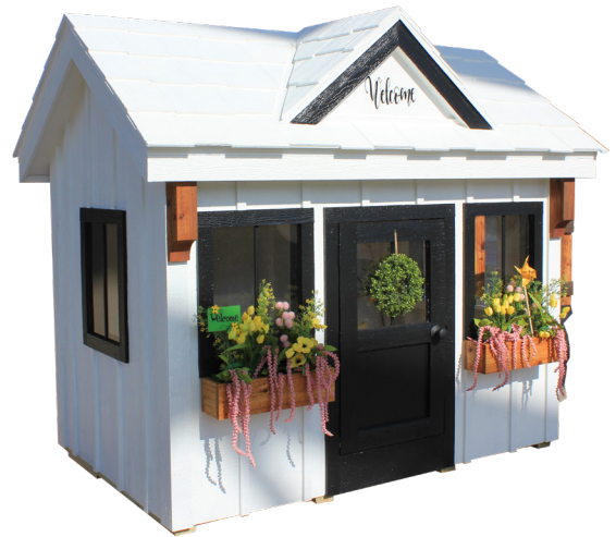
Gary Kerns Homebuilders | 2021 Playhouse