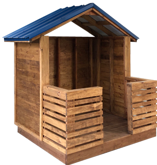
Gardner Edgerton School District | 2020 Playhouse