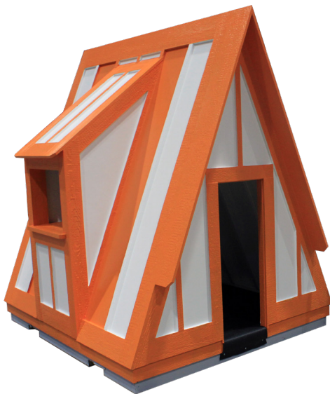
Ernst Brothers Construction | 2020 Playhouse