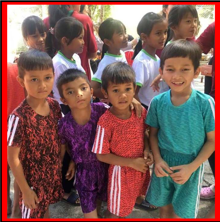
MERRY CHRISTMAS & HAPPY NEW YEAR From the boys and girls of Vinh Son and Sao Mai