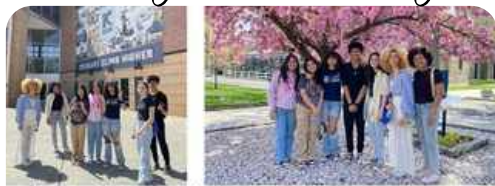
Step-Up Stepping into the Future! Kean University College Tour