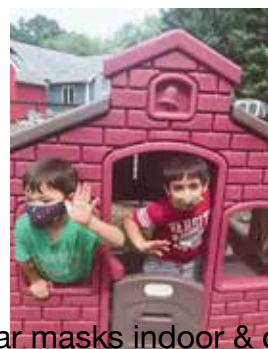
Wear masks indoor & outdoors