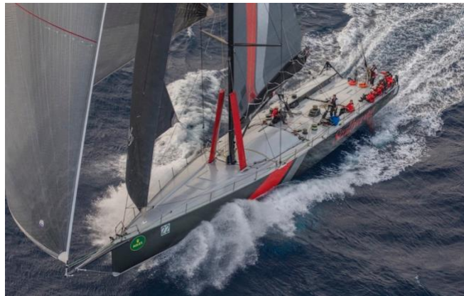
30.48m Scallywag 100 (HKG)