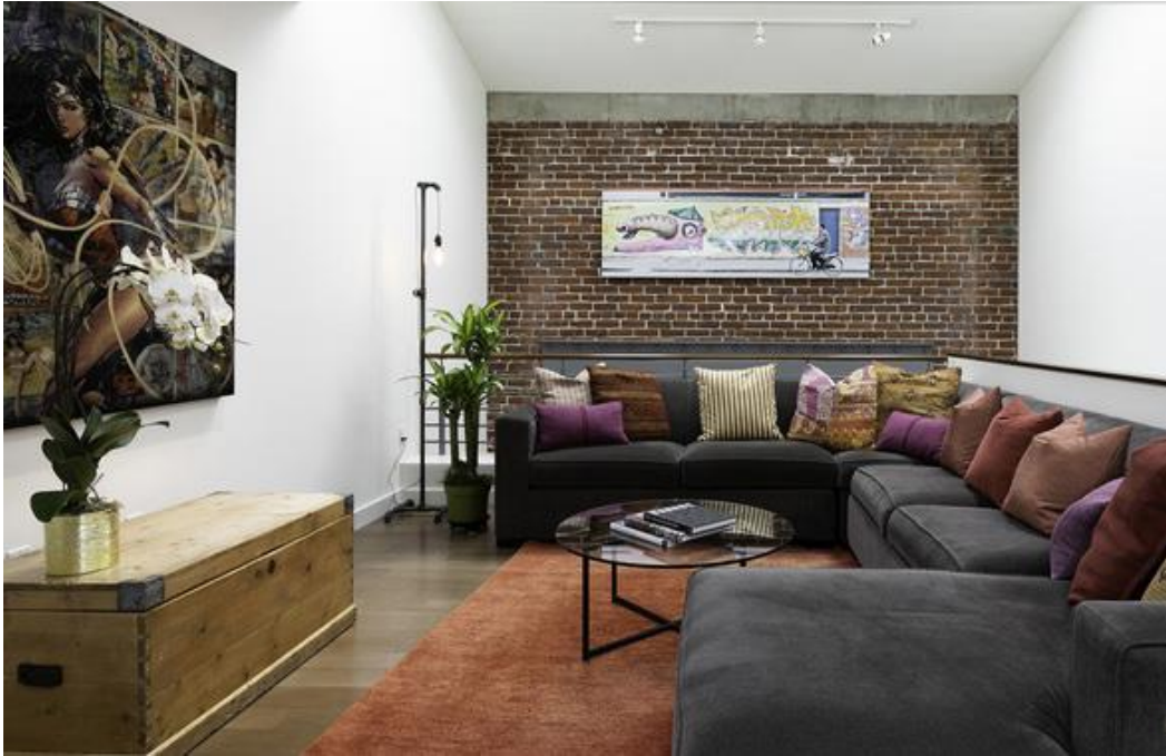
FIGURE 1 - MAY 2019 HIGHEST SALE. 940 E. 2ND STREET