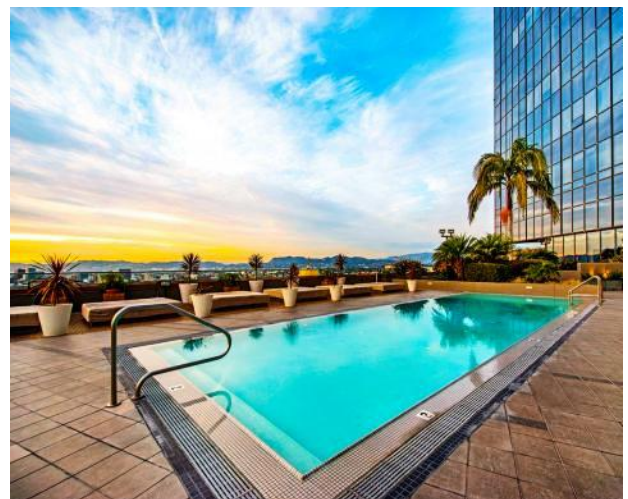
FIGURE 3 - 1100 WILSHIRE